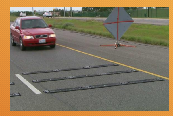
Temporary Rumble Strips