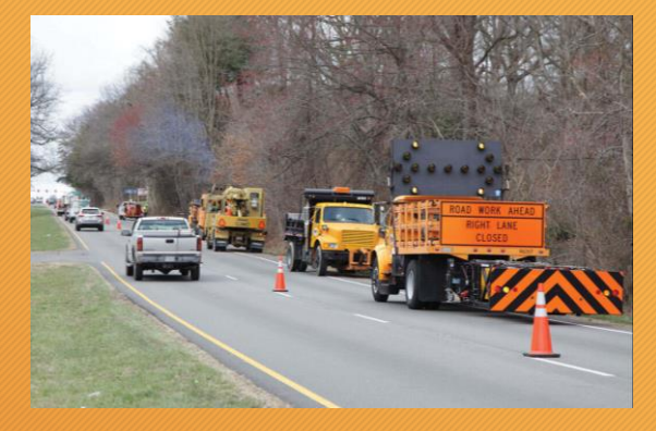
Truck Mounted Attenuators