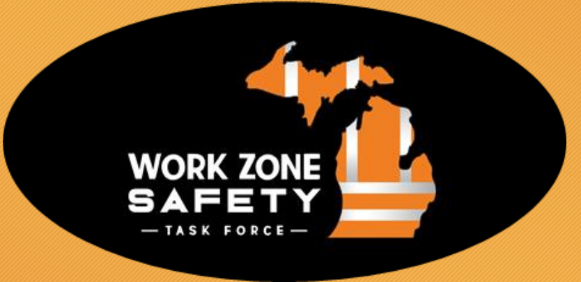
NATIONAL WORK ZON AWARENESS WEEK 2018 WORK ZONE SAFET EVERYBODY'S RESPONSIBILITY. Marketing